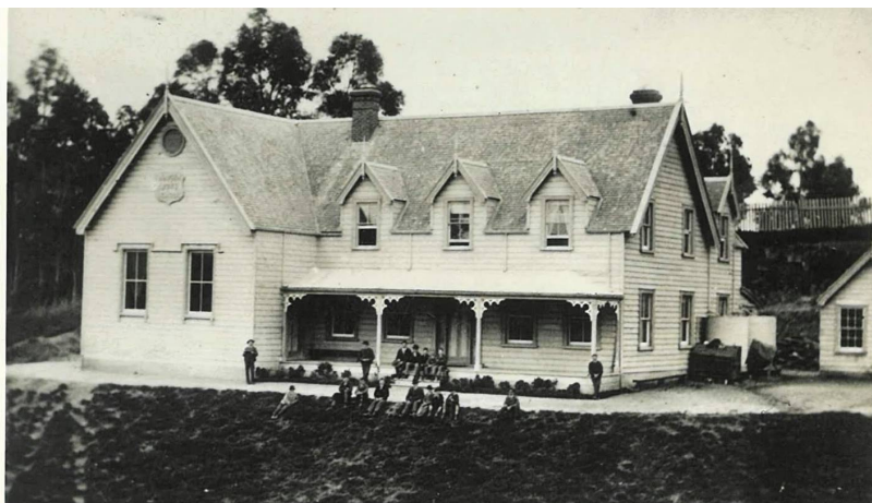
Napier Boys' High School at its original site in Clyde Rd, Bluff Hill.

"The evidence is shown in the wonderful boys to men who have passed through Napier Boys' and are now giving back and part of the community," he said, noting generations of families had been through the school.