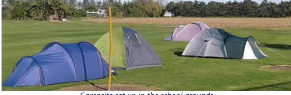
Campsite set up in the school grounds