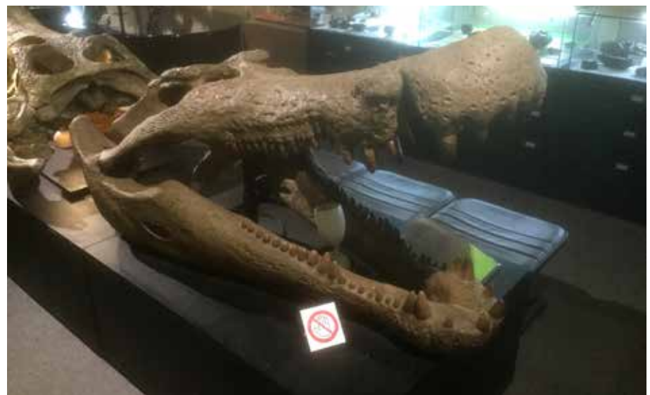
The remains of a late Cretaceous period crocodile housed in the Hokkaido University Museum.