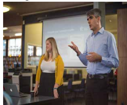
American Embassy Fulbright Scholarships Team

Please ring me during Course Selection time or any career enquiry to make an appointment with you and your son regarding his ongoing very important subject selection and future direction. My number is 06 8335900 ext 220 or email me at claur@nbhs.school.nz