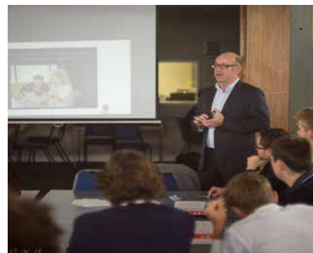
College House (from Canterbury University) presentation

Looking ahead if any of your son's are keen to attend a UC Summer Science Camp for year Year 11 in December there are five Diversity Scholarships available please go to collegeofscience@canterbury.ac.nz .