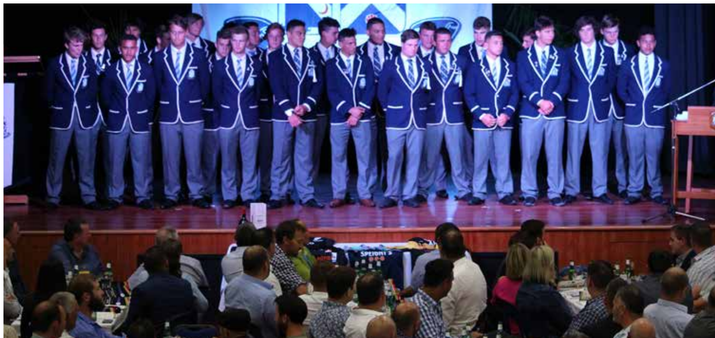
Rugby Dinner Fundraiser