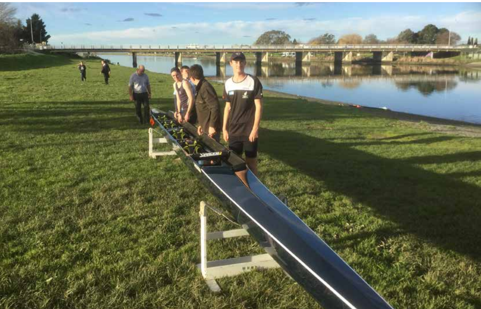
Our new rowing four!