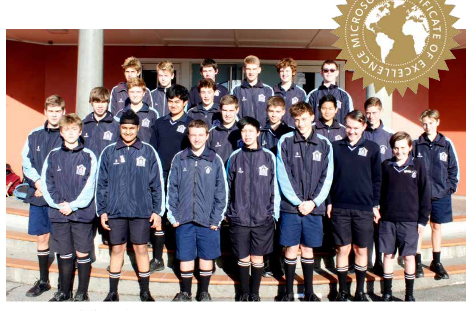
Current Microsoft Office Specialists Masters