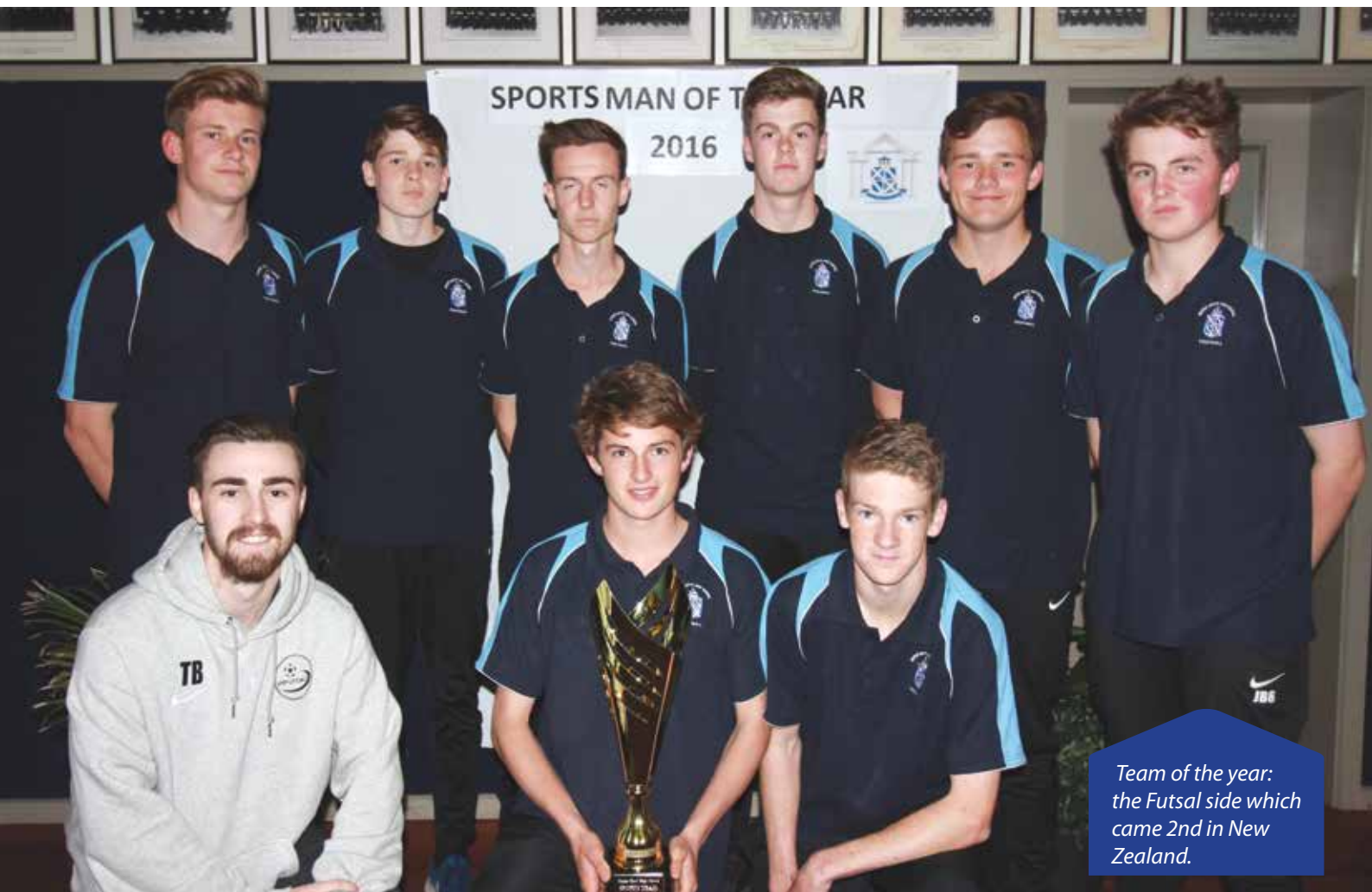
Team of the year: the Futsal side which came 2nd in New Zealand.