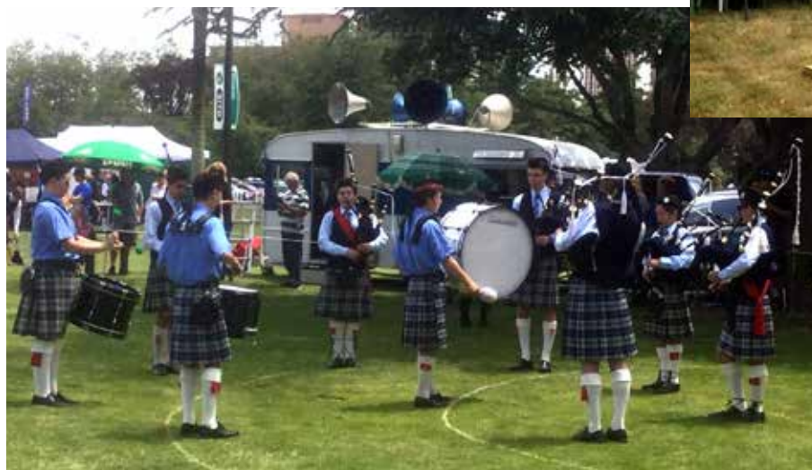
Square Day, Palmerston North – Youth Band Event