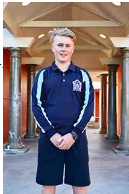
New style winter shirt

When hiring blazers & grey pants each student pays for the time used for each specific event. It is very frustrating when staff have to chase up students who have not returned uniform – especially if it was hired for weekend use only. We look forward to receiving the rugby season hires back into stock in good condition as soon as the rugby season has ended and would be very grateful if parents can ensure this happens promptly.